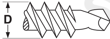
Fine Thread Drill Point Drywall Screw